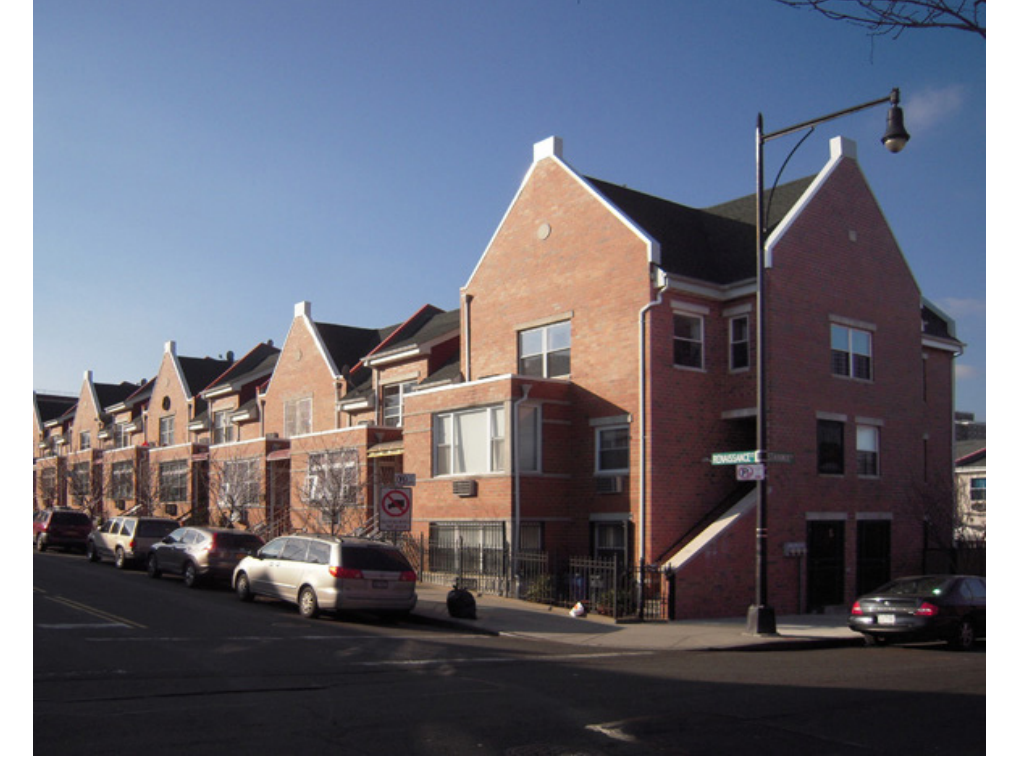
Rheingold Gardens Phase One townhouses.

Coordination, especially the timing of commitments and actual funding so construction could proceed expeditiously, was crucial. The Bushwick community was largely supportive, if skeptical, and was kept involved by the RBSSC.