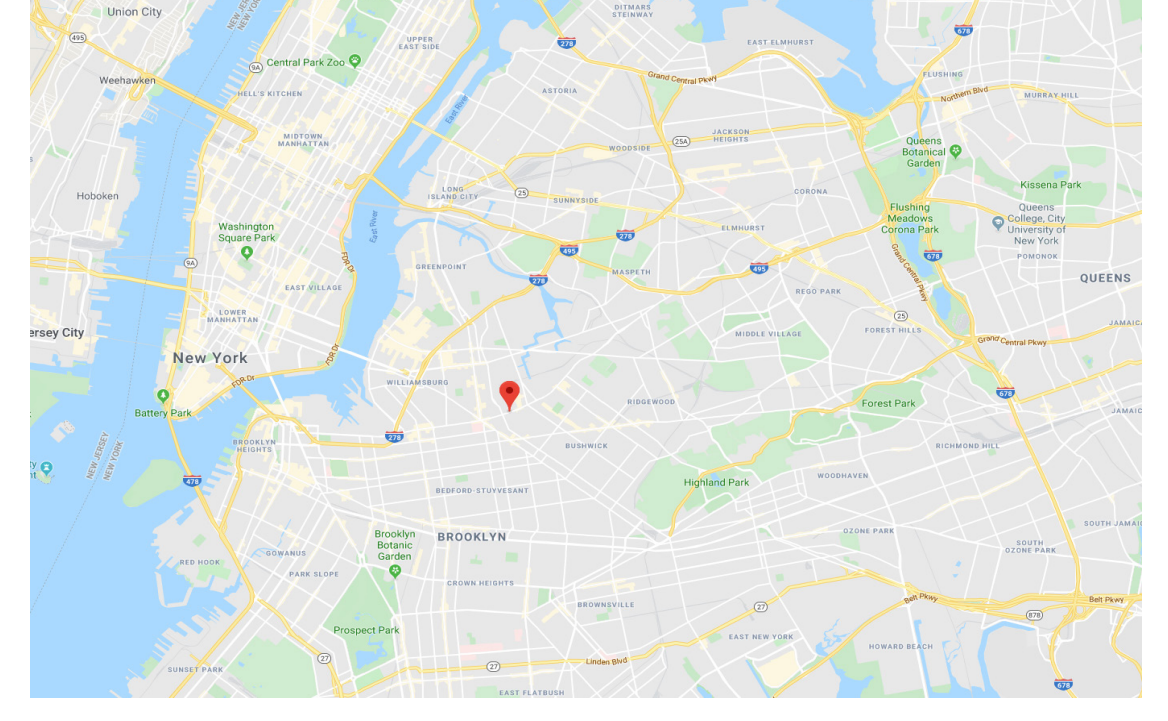
Location of Rheingold in Bushwick, Brooklyn, New York .