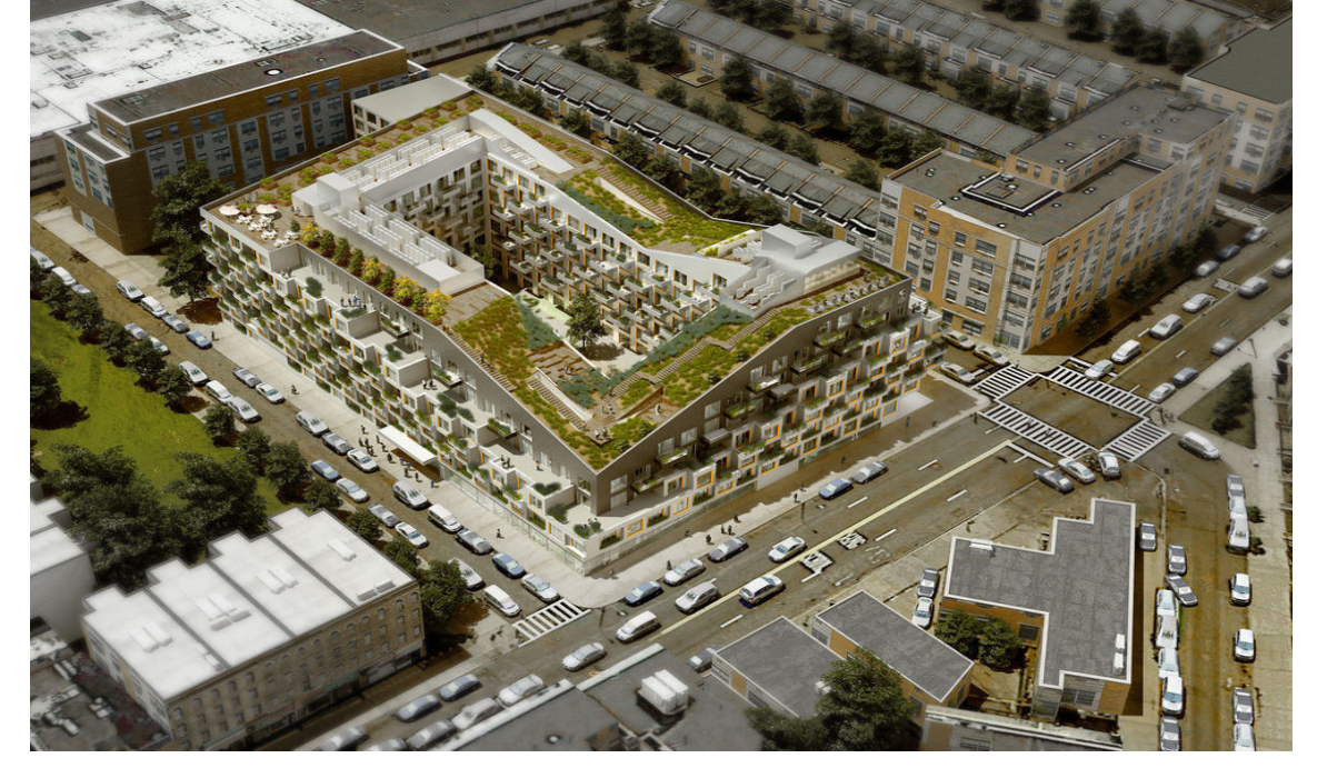
ODA "The Rheingold," design and construction as of April, 2019.

(Amazon's Alexa), other automation such as a computerized concierge that accepted deliveries, and other amenities clearly aimed at younger tenants.