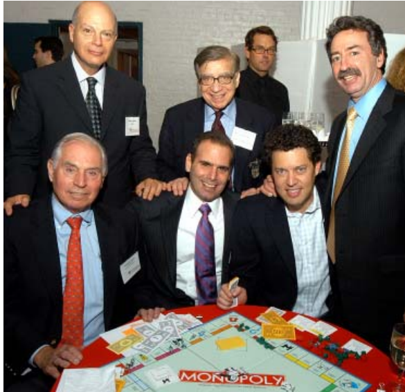
High Stakes Players